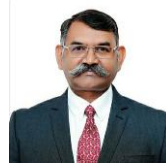
Cmde A Madhava Rao CMD, BDL