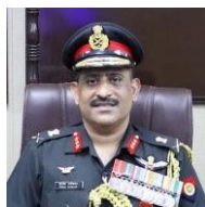
Lt Gen V. Nambiar SM DG Army Aviation