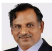
Dr. V. Narayanan Chairman ISRO