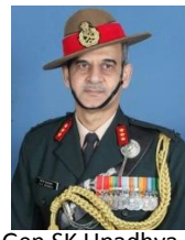
Lt Gen SK Upadhya MGO, Indian Army*