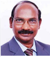
Dr K Sivan Chairman ISRO