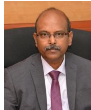
MV Gowthama CMD, BEL: