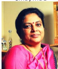
Dr Tessy Thomas DG Aero, DRDO