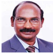
Dr K Sivan Chairman/ ISRO