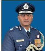
Air Mshl Vibhas Pande AOM, IAF