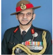
Lt Gen SK Upadhya MGO, IA